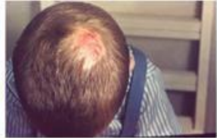
Ringworm on the scalp