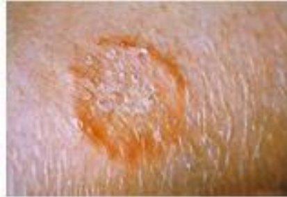
Ringworm on the arm